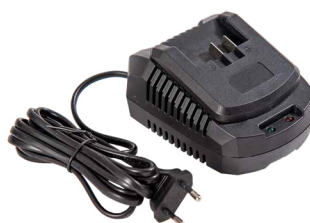
ART. 015-3185-000 Multi purpose wide range input charger (12-240 V / 50-60 Hz)