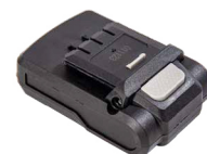
ART. 015-3186-000 Li-Ion battery 20V - 2000 mAh