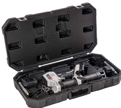
ART. 015-3180-000 The plastic carry-along case has space designed for an additional battery

It is designed to offer an unmatched flexibility and high-quality performances. This is the ideal product for a daily greasing and maintenance work.